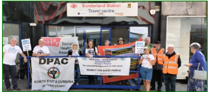
Sunderland pensioners and vulnerable groups Public protest 25 August 2023